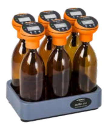
OxiTop®-IDS Set IS6

All measurements with the OxiTop®-IDS can be documented with a data acquisition program (download from www.wtw.com) using the USB interface of the meter.