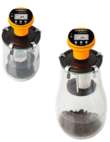
OxiTop®-IDS B6M 2.5 for AT4 tests