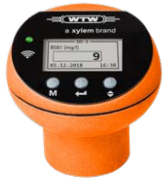
Oxitop®-IDS For all applications except biogas

The new OxiTop®-IDS is a modern measuring instrument for all kinds of respirometric studies. Regardless whether aerobic or anaerobic examinations, because of its versatility the OxiTop®-IDS is suited for both. All heads can be used independently from any meter for normal BOD measurements between one and seven days.