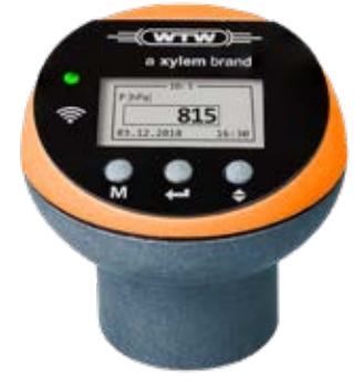
Oxitop®-IDS/B for all applications including biogas